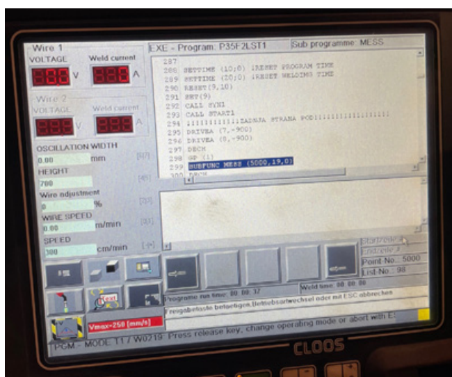
Figure 1 Template 19

After the welding process with the existing Template 19, we transferred the robot to the measurement and later welding process. Figure 1 shows the path taken by the robot when making the weld. When programming the robot on template 19, the path taken by the robot is plotted.