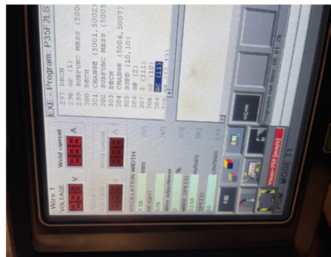
Figure 3 Oscillations

Figure 3 shows the oscillations in the sensor measurement. According to figure 1 we can see the difference in the oscillation width and height, Wire adjustment and Wire speed. These are all values that the robot has recorded during the measurement and welding process. Oscillation in width is 1.58 mm, Wire adjustment is 2% and Wire speed is 13.50 m/min. The results are shown in the table 1: