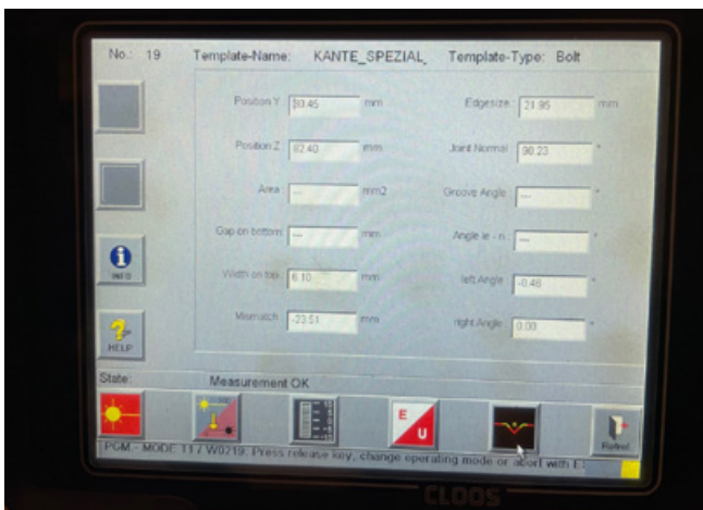
Figure 2 Deviations from the entered and measured path

The red line shows the plotted path while the green line shows the actual path that the robot went through while welding. We can notice that the difference in the path of the weld entered during programming and the actual, performed path is almost imperceptible, and we conclude that the sensor in this case correctly measured the path by the robot arm. The unit of deviation during the measurement was within the allowed limits, so the robot continued with the welding process. Given the large number of external factors that in this case could have caused damage during the operation of the sensor, which, among other things, partially affected the measurement of the sensor, it can be concluded that in this case the sensor performed the correct measurement. After comparing the programmed trajectory with the actual one and determining a small deviation within the limits, the robot starts its welding on the boiler.