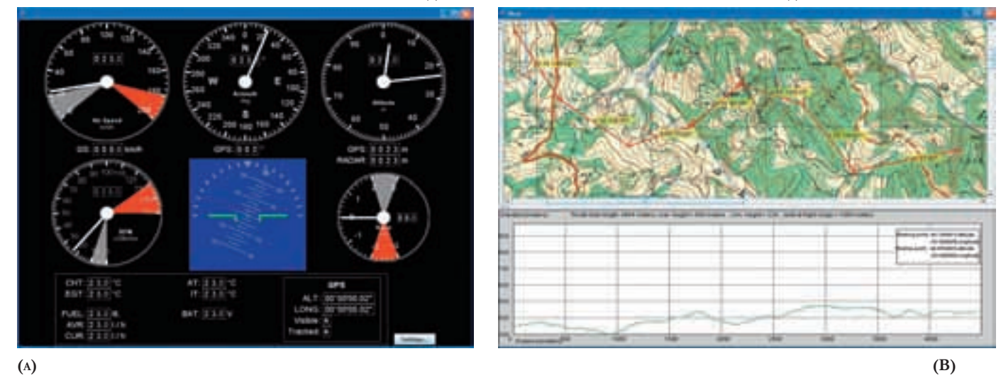
FIG. 3. INSTRUMENT TABLE AS INSTANCE OF COMPLEX MODALITY (A), AND THE WINDOW SHOWING AIRCRAFT MISSION ROUTE (B).

Proposed approach describes all effects introduced by the instrument table. However, for more detailed analysis, it is useful to include a notion of a visual scan, which is currently partially addressed by our approach. Visual scan considers a sequence of monitoring tasks associated with flight status. Scan characteristics (where to look, how frequently