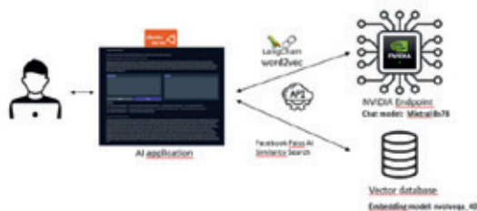
Figure 4. Our applied workflow of application and user interaction from user request to LLM response

Availability of the Mixtral8x7B AI model on the NVIDIA NGC catalog underscores NVIDIA’s commitment to advancing AI research and development by providing access to state-of-the-art models and tools. This collaboration between Mixtral and NVIDIA facilitates the democratization of AI technology, empowering developers and organizations to leverage cutting-edge AI capabilities for a wide range of applications and use cases.